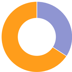
Gender of Group

On average in 2023, 5 or more Care-experienced young people consistently attend a CiCC meeting.